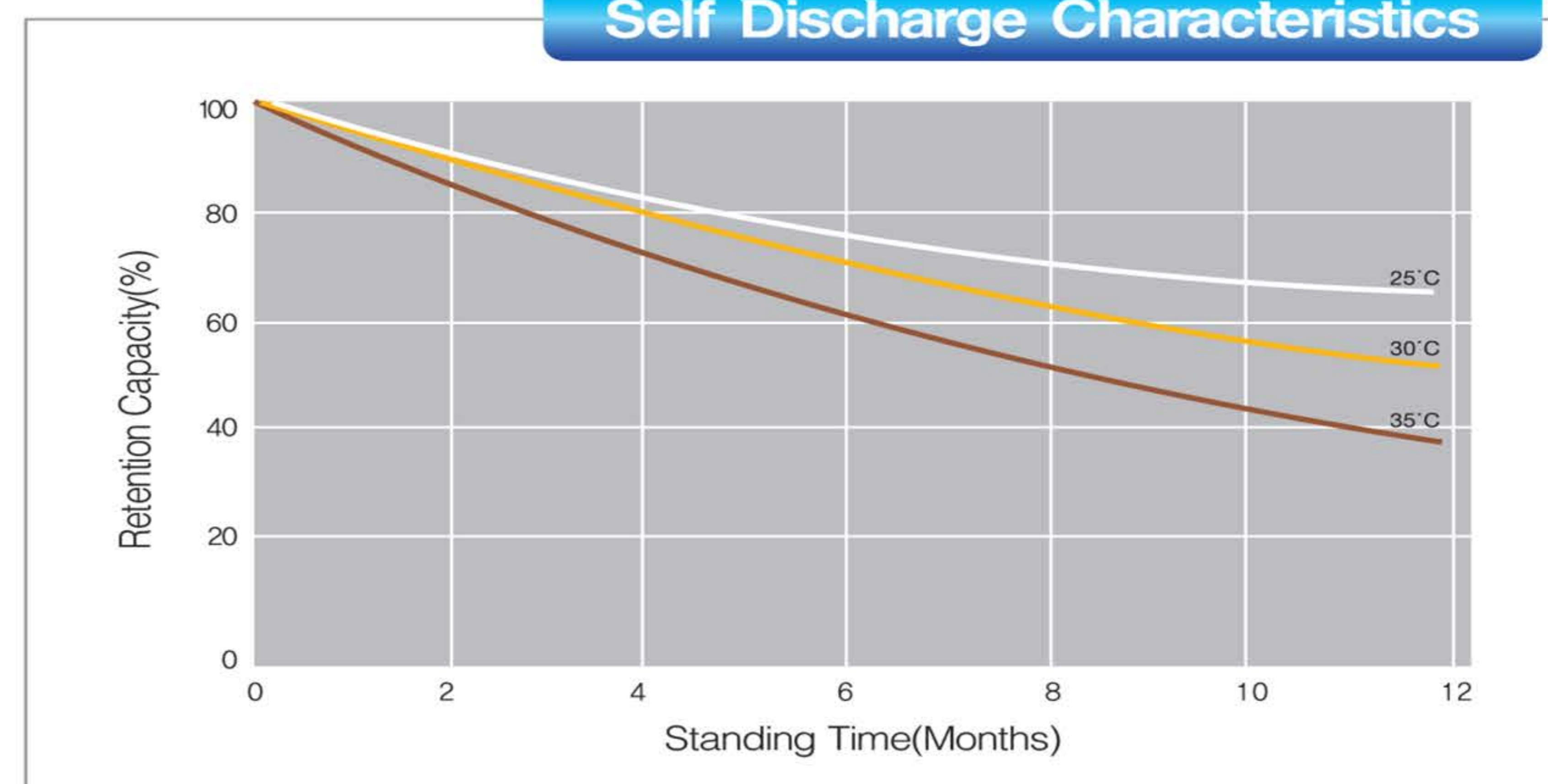
Self Discharge Characteristics